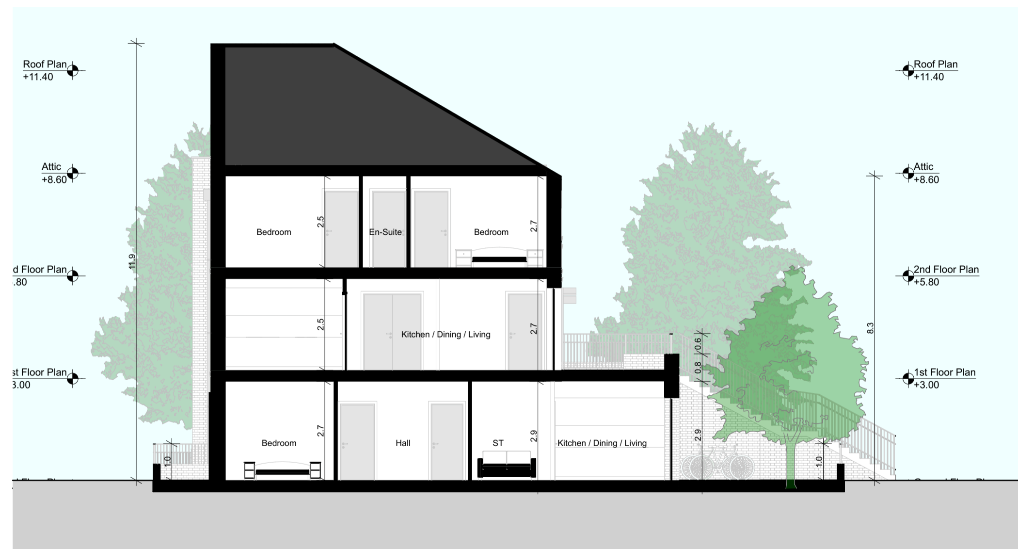
SECTION 01 SCALE 1:100