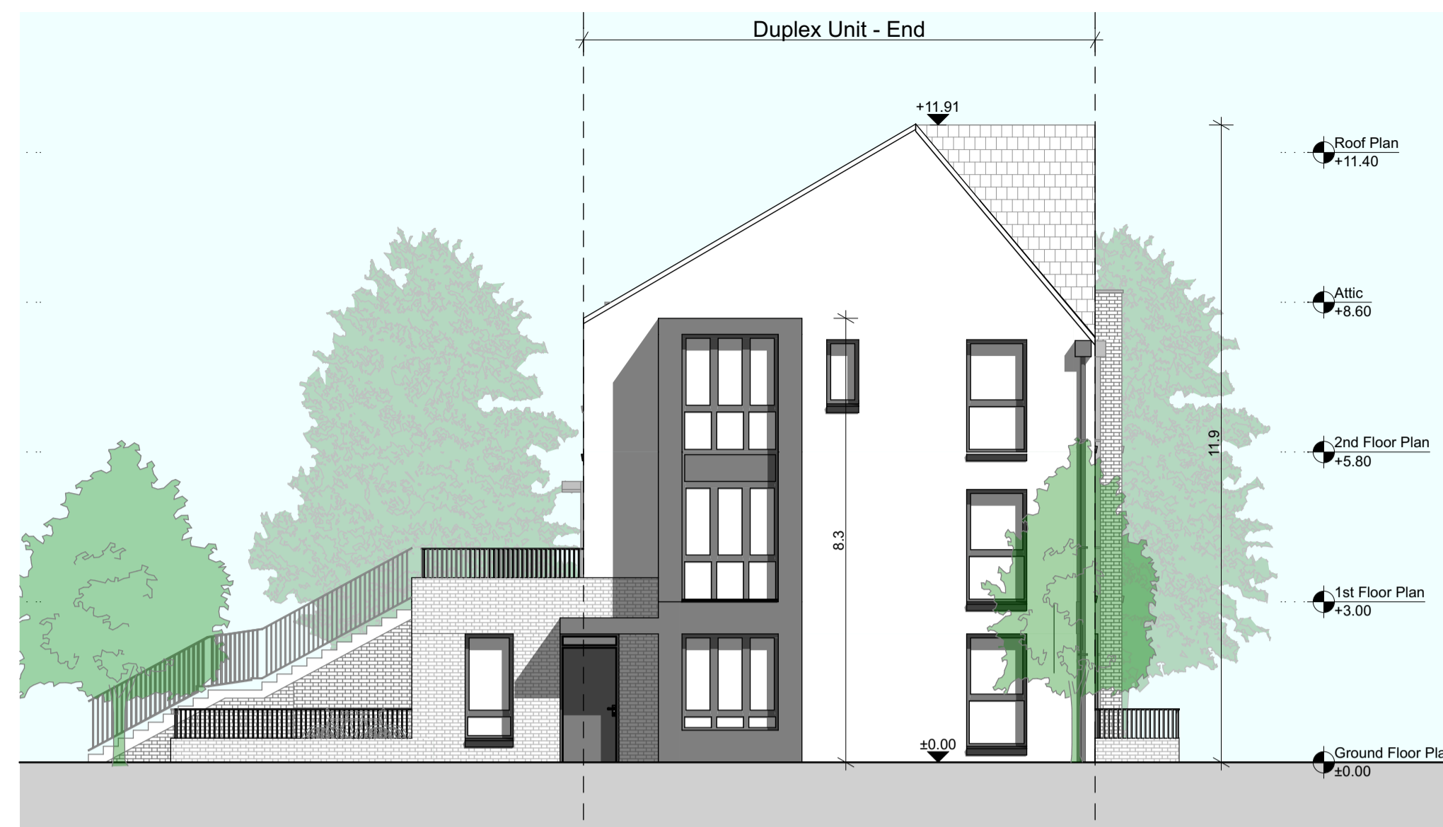
SIDE ELEVATION 01 SCALE 1:100