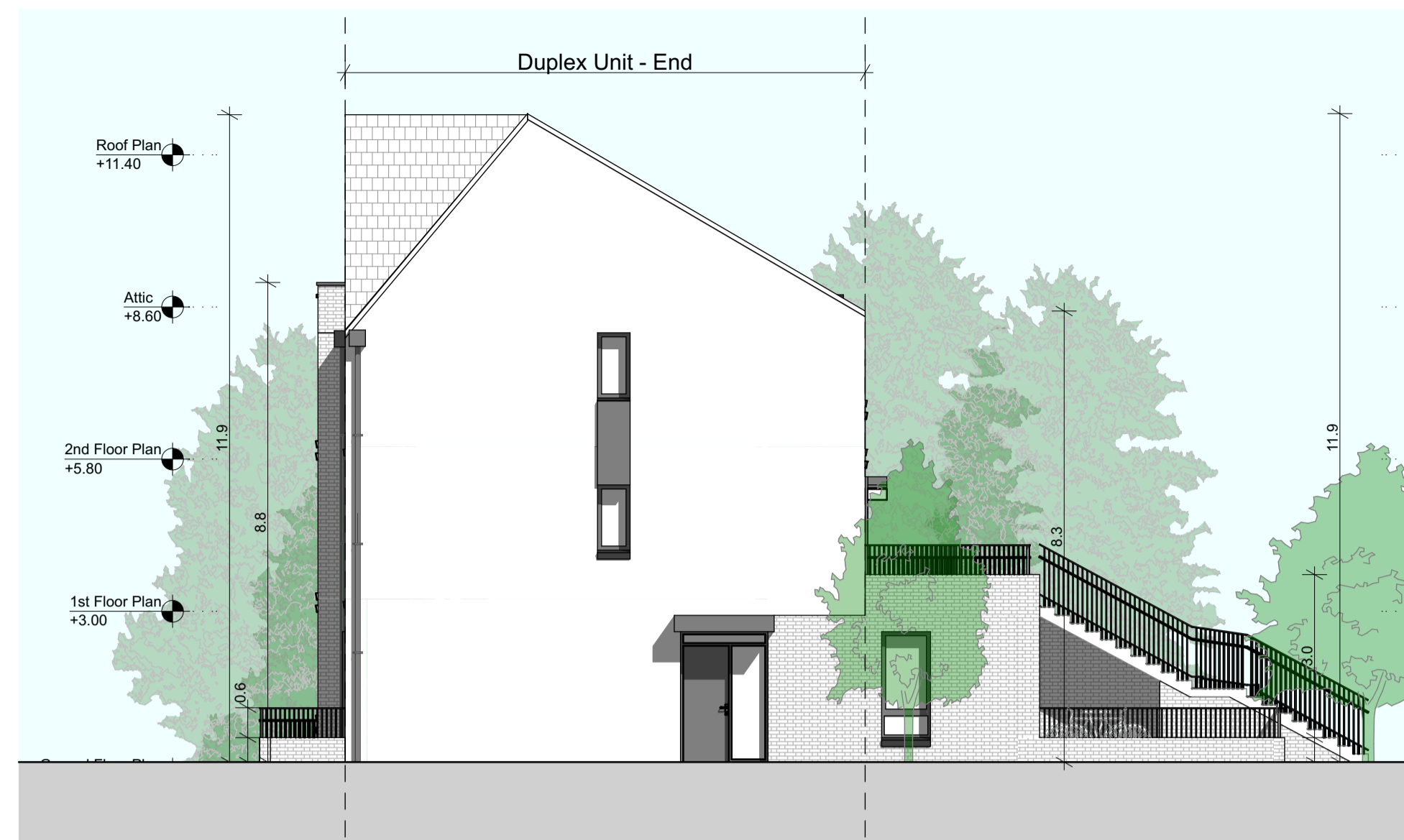
SIDE ELEVATION 02 SCALE 1:100