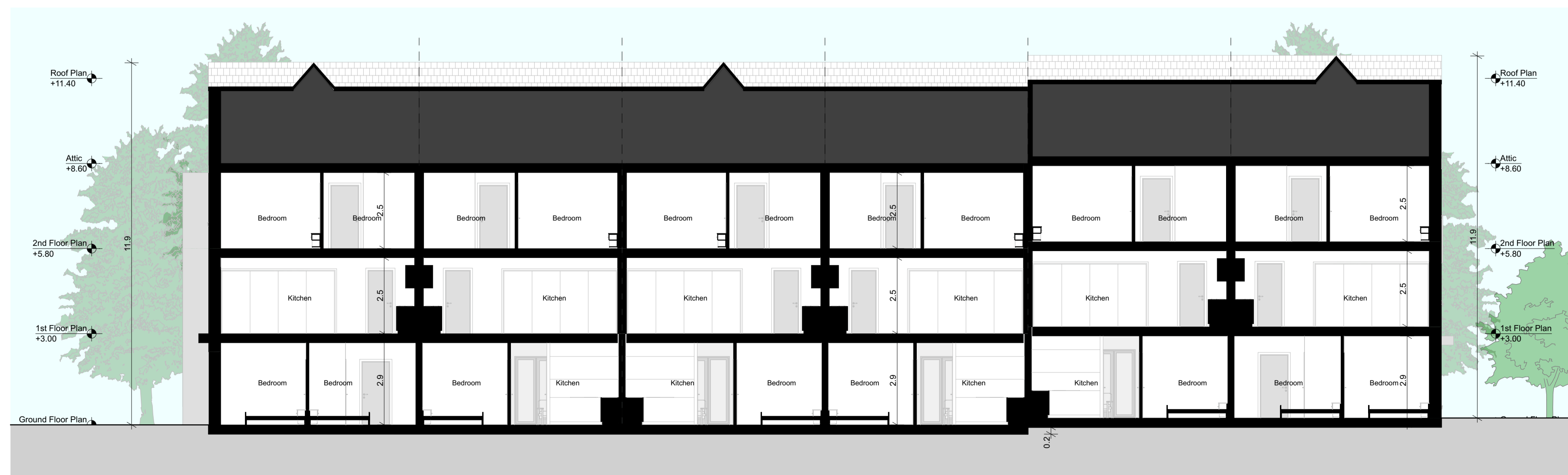
SECTION 02 SCALE 1:100